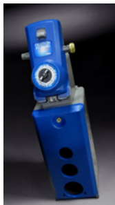
Dilution System with key lock out 00378