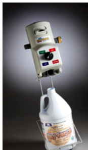
Dilution System with wire rack 00376

PUMP&GO dispenser- Portions out 1/4 oz. of H2O2 Oxy-Force® with every pump for easy maintenance.