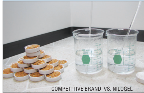
COMPETITIVE BRAND VS. NILOGEL