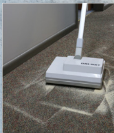
Agitate with a Dri-Way Jr. machine using a back and forth and crosswise motion working the compound into the carpet nap.