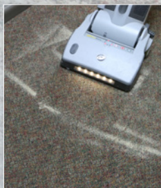
Allow area to dry while proceeding with another 5 ft. x 5 ft. area. Vacuum entire carpet with brush type upright vacuum.

Dri-Way+® Compound coverage is 550-650 square feet per 5 lb., depending on the type of carpet