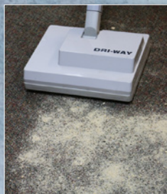
Sprinkle Dri-Way+® Compound generously over a 5' x 5' carpeted area to be cleaned.